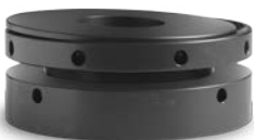
SKF Vibracon chocks