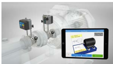
SKF Shaft Alignment Tools