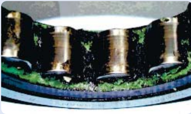
Lubricant degradation caused by electrical discharge currents