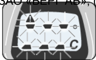
Out of range