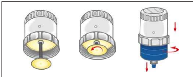
Fig. 3 – Pressure plate positioning