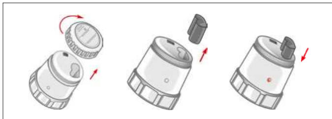
Fig. 4 – Battery replacement procedure