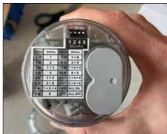
Fig. 5 – DIP Switch and respective settings table

The SKF TLRD lubricator is equipped with a test mode which enables users to test the lubricator before use. To start the test mode before operation, please follow the steps below: