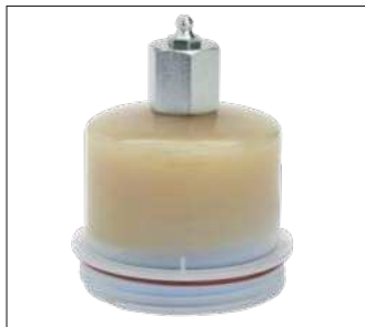
Fig. 2 – Filling adapter